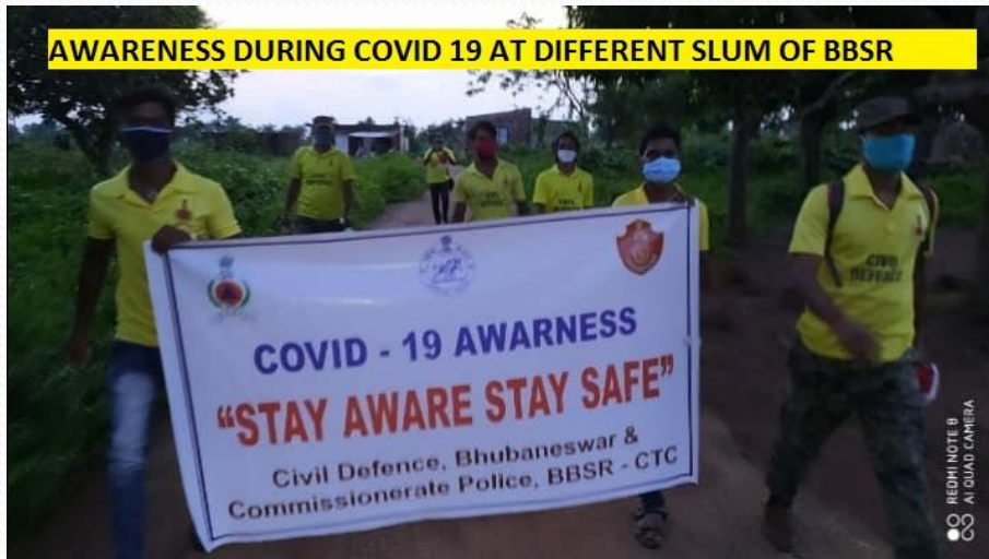
AWARENESS DURING COVID 19 AT DIFFERENT SLUM OF BBSR